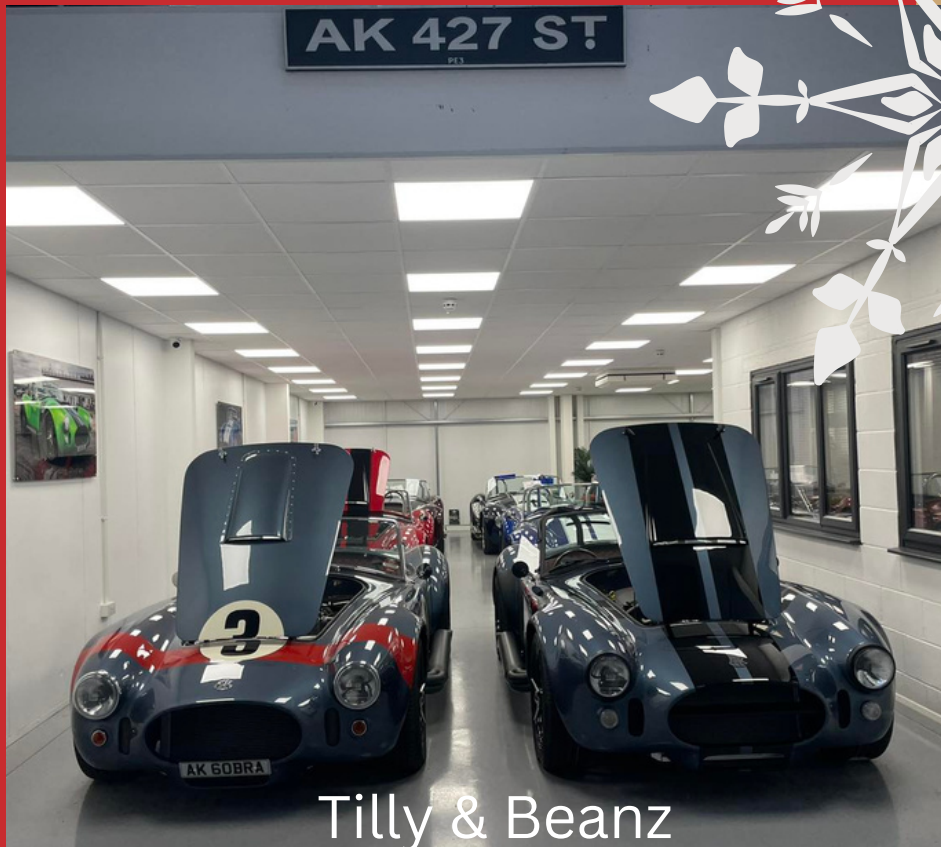
Tilly & Beanz

We were asked to create a “More aggressive” version of Tilly our demonstrator car for a client in Cyprus.